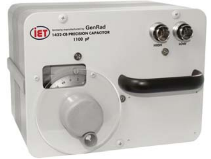
Model 1422-CB/CL Precision Capacitor