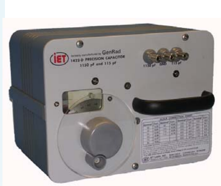
Model 1422-D Precision Capacitor