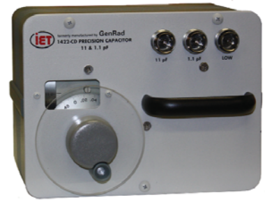
Model 1422-CD Precision Capacitor

Two-terminal - The 1422-D is a dual-range 115 pF and 1150 pF, two-terminal capacitor, direct reading in total capacitance at either range terminal to ground.